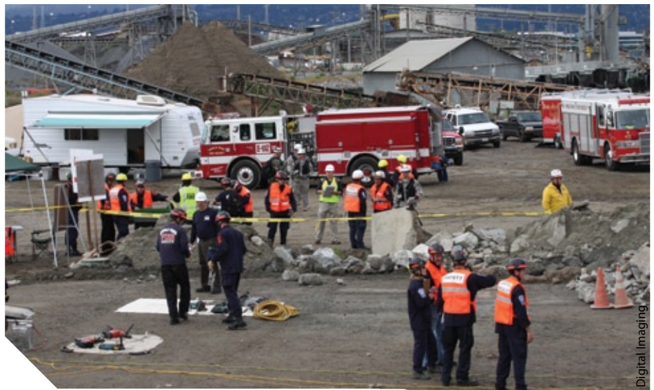
▲ With rescue efforts well under way, first responders and local mutual aid departments await their assignments from Incident Command.

A simulated pipe failure at the Valero Oil Refinery releases thousands of gallons of gasoline and prompts the evacuation of the refinery and a nearby bridge closure.