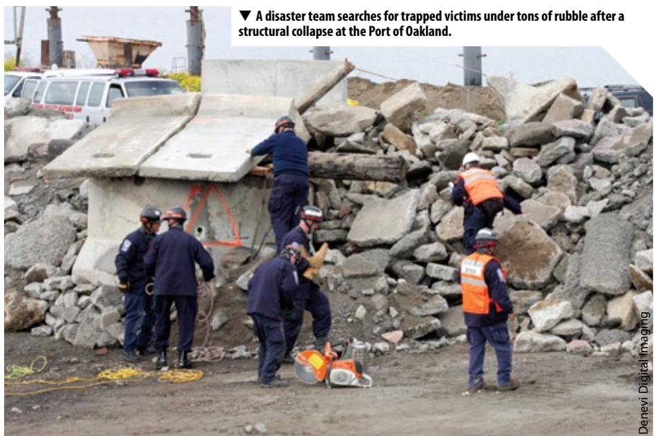
▼ A disaster team searches for trapped victims under tons of rubble after a structural collapse at the Port of Oakland.