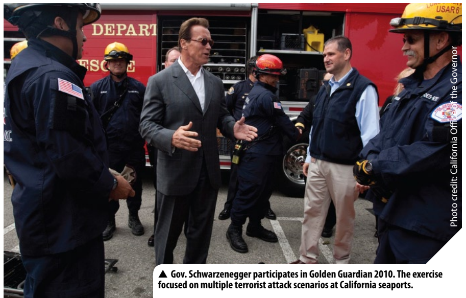
▲ Gov. Schwarzenegger participates in Golden Guardian 2010. The exercise focused on multiple terrorist attack scenarios at California seaports.