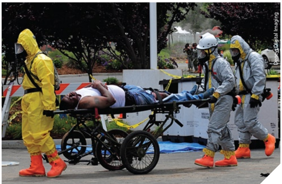
▲ A HazMat decontamination crew transports a "victim."