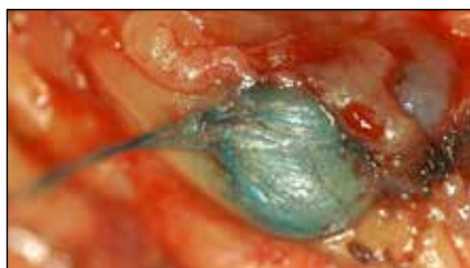
Figure 1. Lymph node coloured blue in nodal basin

In SLNB a blue dye and/or radioactive tracer is injected around the primary melanoma on the skin ( Figure 1 ). The tracer finds its way to regional drainage lymph nodes. The closest